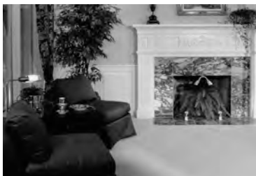
[ residential ]

Hypoallergenic. Available in Fragrance Free or RainFresh fragrance. Removes detergent residue. Nontoxic. Biodegradable.