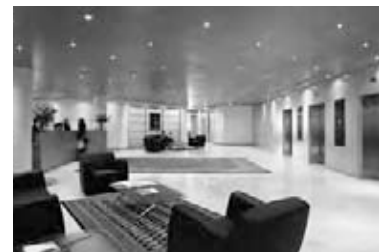
[ area rugs ]